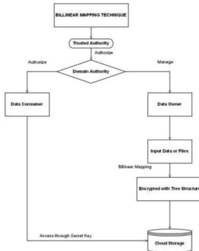
Figure 2. Bilinear Mapping [6]