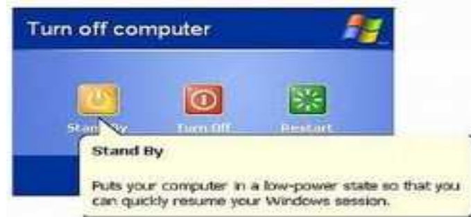
Figure 6. Stand By mode