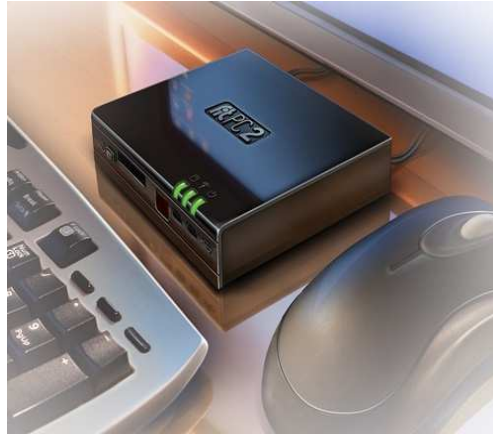
Figure 3. Fit-PC

call centers, education, healthcare, service providers, and finance. PCs have more powerful processors as well as hard drives, something thin clients don't have. Thus, traditional PCs invariably consume a substantially larger amount of power. In the United States, desktops need to consume 50 watts or less in idle mode to qualify for new stringent Energy Star certification [1].