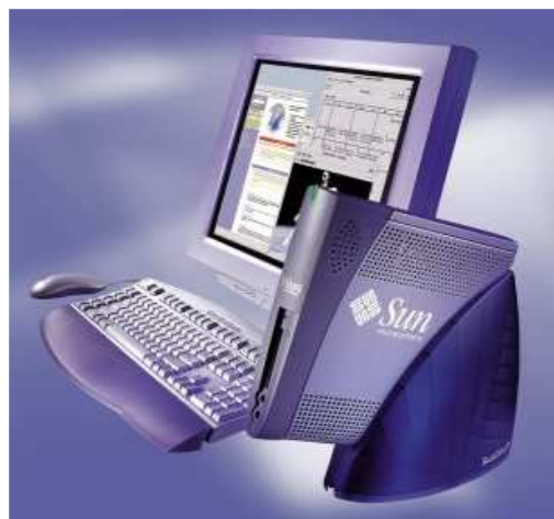
Figure 5. Sunray Thin Client