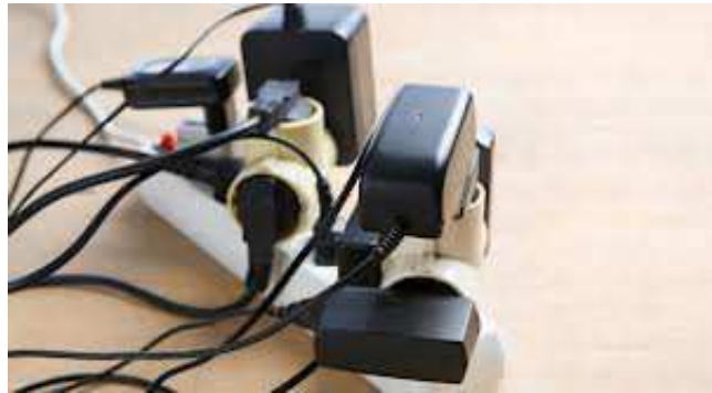
Figure 7. Phantom energy use