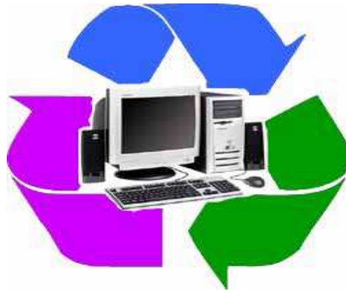
Figure 8. Recycle E-waste