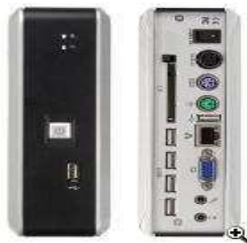
Figure 4. Zonbu computer